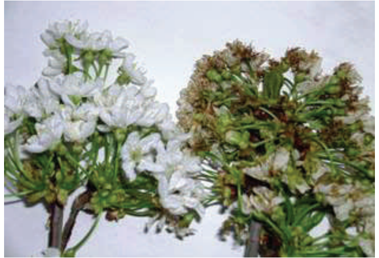
Good flowers on left, damaged flowers on right.

This pest is not yet found in the United States. However, this is an example of a pest that could be very destructive to many different California crops. In this case, though, we already have a potential method for control.