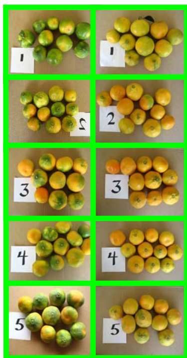
Five early season Satsuma (1='Xie-shan', 2='Miyagawa', 3='S9', 4='Kuno Wase' and 5='Armstrong') before and after degreening treatment with 0.5mg/L ethylene for 72 hours with fruit harvested on October 6, 2004, Santa Paula, CA.

cultivars. 'Xie-Shan' had a higher acid level than the other three cultivars. It had a very unique flavor and taste that was different from other Satsumas. 'Armstrong' had lower sugar level than the other three cultivars and tasted less sweet than the others.