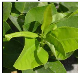
Leaves curled with pupa inside roll of leaf.

characteristics of this insect pest is that it leaves a trail of frass in the mine. Additionally, CLM tends to pupate at the edge of the leaf, causing the leaf to roll around the pupae.