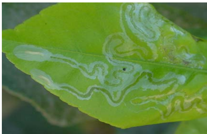
Citrus leafminer on upper surface of young lemon leaves.

Many growers in Southern California are reporting mines in citrus leaves. If you have mines in the leaves you likely are seeing Citrus Leafminer (CLM). This pest was first reported in California in October 2000. In the past 5 years, it has made its way from Calexico (2000) to the Coachella Valley (2002), to