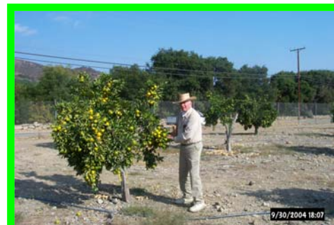
2004 Fruit load for 'Miyagawa' Satsuma

quality data were collected from September 1 to December 15, 2004 when collections were ended due to record rainfall and